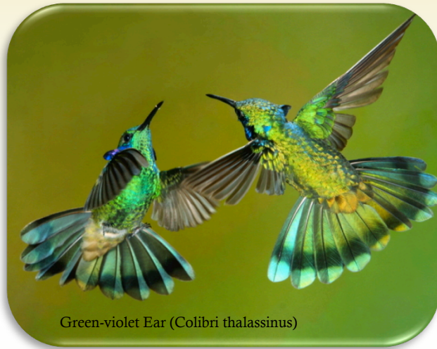
Green-violet Ear ( Colibri thalassinus )