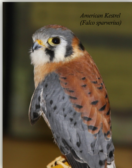
American Kestrel (Falco sparverius)