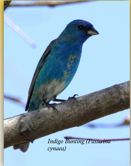
Indigo Bunting (Passerina cyanea)

www.discoverlife.org/mp/20p?res=320&see=I_LHT/0030