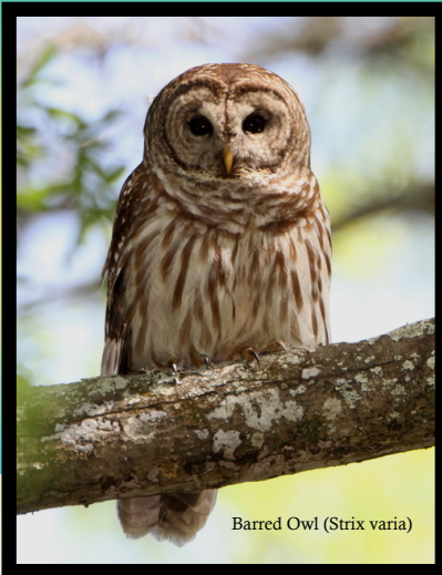
Barred Owl ( Strix varia )