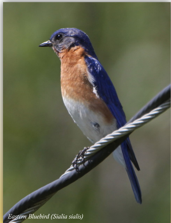
Eastern Bluebird ( Sialia sialis )