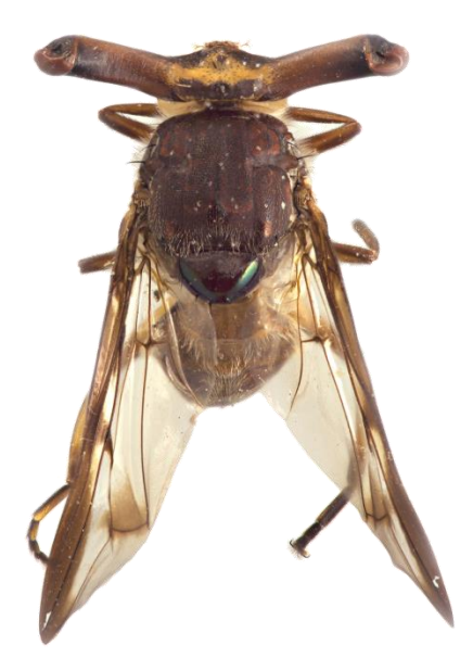
Stalk-eyed fly (Diptera:Platystomatidae)

Wingless dipterans can be confused with wingless hymenopterans, as they both have an oval or roundish shape and a reduced pronotum. However, in Hymenoptera they have chewing mouthparts and the abdomen is constricted basally.