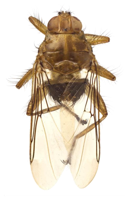
Louse fly (Diptera: Hippoboscidae)